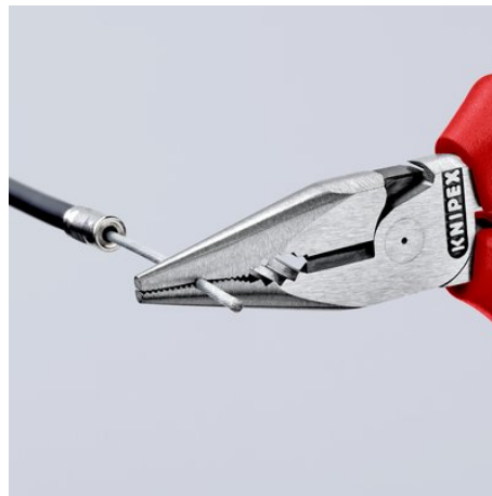
Milled groove in the gripping area